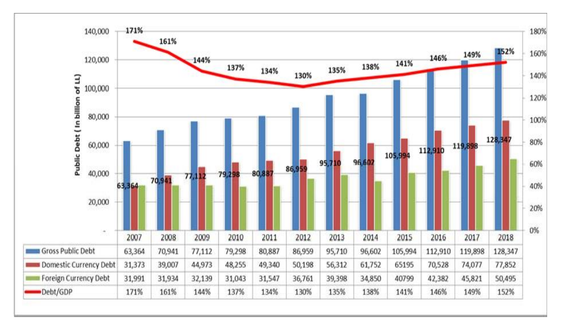
FIGURE 3. DEBT TO GROSS DOMESTIC PRODUCT RATE BETWEEN 2007 AND 2018