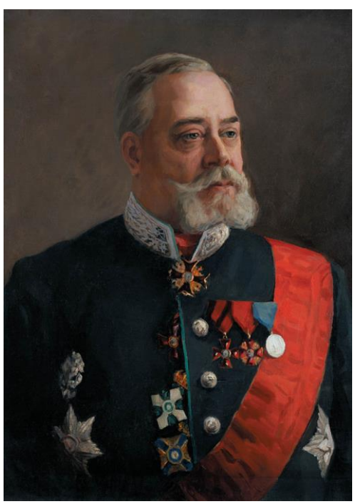
Figure 2. Klavdii Semyonovich Nemeshaev, the Minister of the Ministry of Railways of the Russian Empire from October 28, 1905 to April 28, 1906 (Ministry of Transport of the Russian Federation).

In his analysis of the activities of Witte's Council of Ministers, the famous statesman of the Russian Empire Vladimir Iosifovich Gurko, divided the new government into three groups (Ilyin, 2006, pp. 352–353). According to him, the first group consisted of the Prime minister's henchmen who did not dare to object to him. In his opinion, this group comprised I. P. Shylov, N. N. Kutler, and K. S. Nemeshaev. The second group tried to show independence in managing their departments but in the Council of Ministers they invariably sided with the Prime minister. V. I. Gurko claims that I. I. Tolstoy, V. I. Timiryazev, D. A. Filosofov and V. N. Lamsdorff belonged to this category. The third group was constituted by ministers who were only pro forma members of the Council, namely A. F. Roediger, A. A. Birilyov and V. B. Fredericks. They were direct subordinates to the tsar, but tried not to break the unity of the Council of Ministers and attended its meetings regularly. Gurko concludes: "It is clear from the aforementioned that in the meetings of the Council, Witte was the complete master of the situation and had a well-secured majority on every issue." (Sidelnikov, 1980, pp. 69–70,).