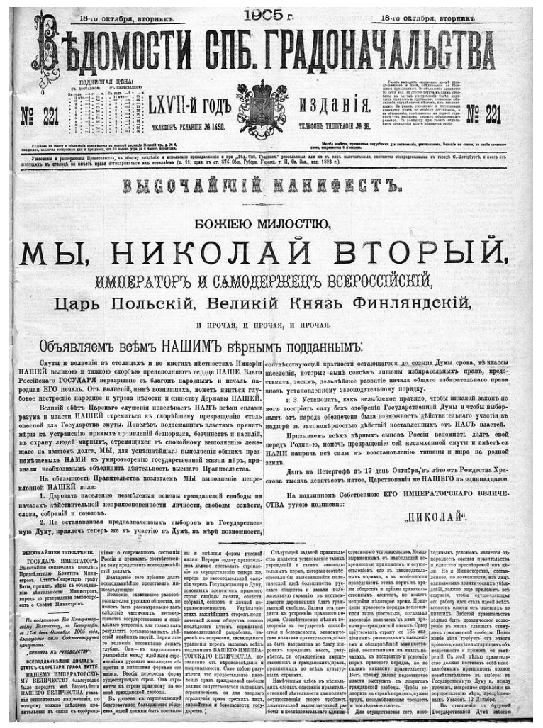
Figure 1. The October Manifesto issued by Nicholas II of Russia in 1905 (Romanov, 1905).

Organization and Agriculture, the State Controller and the Chief Prosecutor of the Synod. The heads of other departments only participated in the Council meetings regarding matters directly related to authority of their departments. The chairman of the Council of Ministers was not the emperor himself, as was the case before, but a person appointed by him from among the ministers. S. Yu. Witte was the first person to be appointed as the chairman of the Council of Ministers. He had previously held the honorary but still in-name-only position of the chairman of the Committee of Ministers.