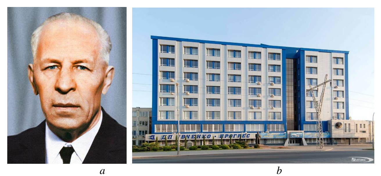
Figure 2. Chief Designer (1963–1968; 1968–1981) General Designer of the Zaporizhia Machine-Building Design Bureau "Progress" (1981–1989) ( a ); the building of the central building "Ivchenko-Progress" today ( b ) (Ivchenko, 2014, p. 9).

Recognized designer-scientist received the right to run as a corresponding member of the Academy of Sciences of the USSR Department of Mathematics, Mechanics and Cybernetics, specialty – "Mechanics" (DAZO. F. R-5444. S. 1. F. 136. p. 2).