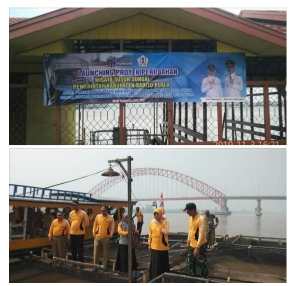
Figure 3. Launching Susur Sungai Barito Kuala