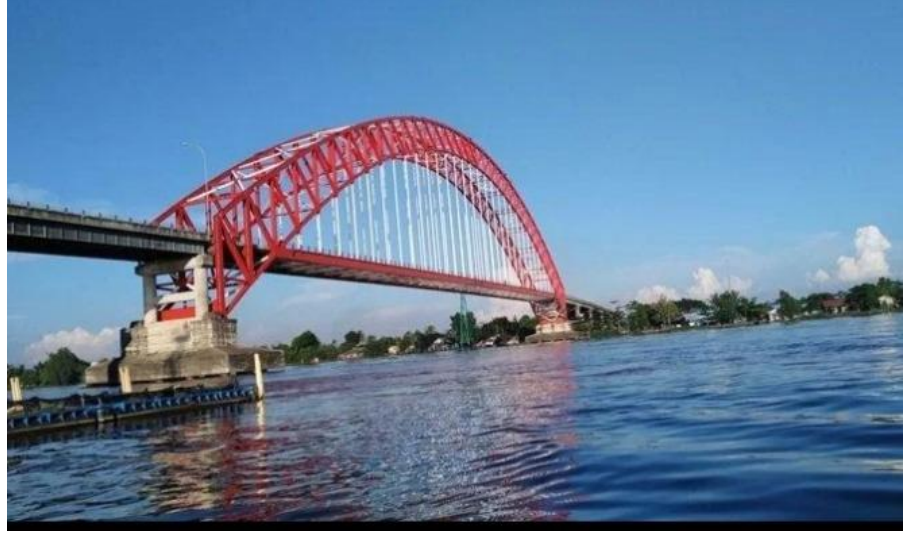
Figure 1. Rumpiang Bridge

after working for a while after having the capital to explore other regions or countries, called domestic tourism and foreign tourism.