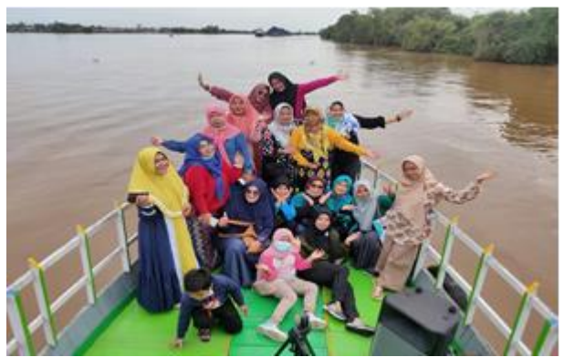
Figure 4. Digital tourism development programs for millennials

The three digital tourism development programs for millennials, namely the Wonderful Startup Academy, Nomadic Tourism, Digital Destinations (figure 4), have made the Indonesian tourism industry more famous abroad and can provide additional foreign exchange for regions and even countries.