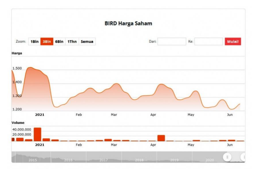
Figure 3. Stock Value of PT. Blue Bird Tbk (BIRD) Period 28 December 2020 to 21 June 2021

Seeing the movement of Gojek stock investment chart in several companies that experienced a significant increase after the official announcement of Gojek's merger with Tokopedia on May 17, 2021. The increase in the value of the shares is clearly seen especially in the shares of PT Bank Jago Tbk (ARTO) where Gojek dominates the shares by 21.04 percent