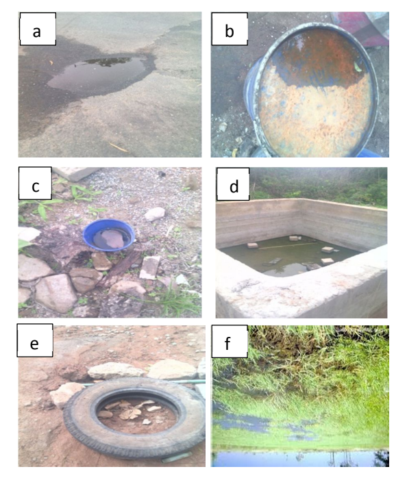
Figure 1: Mosquitoes breeding sites in a university community in Kwara State, Nigeria. (a) Pool of water, (b) discarded metal bucket, (c) discarded plastic container, (d) blocked cistern, (e) discarded tyre and (f) marshy vegetation

On the most common symptoms experienced by the respondents during the last malaria episode headache (29.53 %) by students and 48.35 % by staff was mentioned, whereas cough was the least mentioned by the two groups. Other symptoms mention includes fever, vomiting, weakness and shivering. All the 518 students and 91 staff gave multiple responses including at least one of the common symptoms of malaria (Figure 2).