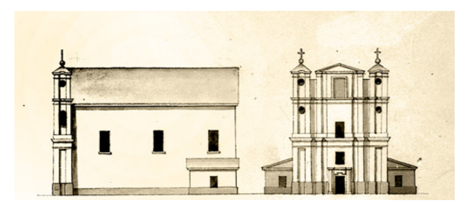
Fig. 3. "The design of the former Carmelites Monastery(...)". Fragment 2.

Fig. 2. "The design of the former Carmelites Monastery in Dubno County, in the village of Dorohostai". Fragment 1.