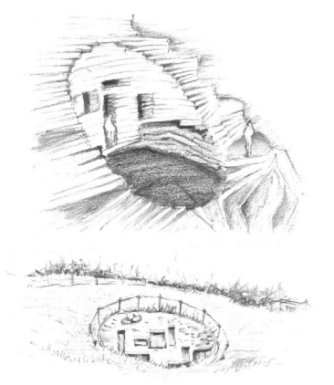
Fig. 2. Villa Vals, proj. SeARCH & CMA (Dżoana Latała-Matysiak, sketch, 2020)