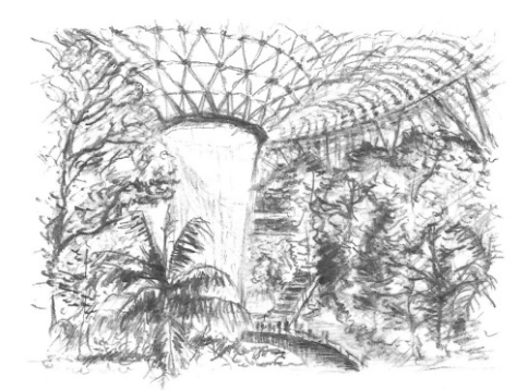
Fig. 8. Jewel Changi Airport – Rain Vortex, proj. WET Design (Dżoana Latała-Matysiak, sketch, 2020)

"The problem of falseness and imitation has been present in architecture actually since the beginning of time" [10, p. 162]. This trend has been enhanced due to the notion of eclecticism, which has been unwittingly imitating the architecture of previous eras. It is the 19<sup>th</sup> century that is often described as "the most imitated and false century in the history of architecture" [10, p. 154]. Imitation continues at its best, mainly thanks to bionic and organic forms, which are modelled on nature. Biblioteca España (Fig. 5), completed in 2007, which towers over the city of Medellín in Colombia, was created in such spirit. The complex comprises three blocks, styled to resemble massive boulders, which due to their placement are perfectly exhibited in almost all parts of the city.