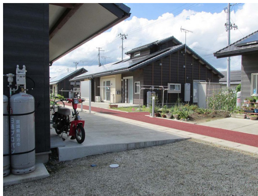
Fig. 5. Example of Fukko Jūtaku built in 2015 in Tamaura-nishi, Iwanuma City (Tōhoku)

Avoiding group members' dispersal prevents isolation and social withdrawal, which is a particularly high risk for refugees [10]. The Tamaura-nishi district (Fig. 5) has been divided into six zones, one for each village, mixing private and collective housing.