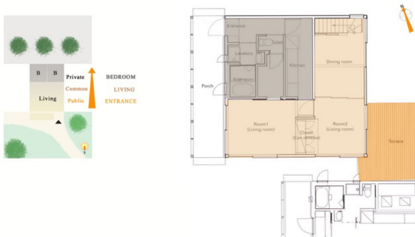
Fig. 6. Example of housing following the living access type

The inhabitants chose the architects for the public housing projects through a proposal competition and a public presentation. These three disaster-relief housing projects (災害公営住宅 saigai kōei jūtaku ) built in Iwanuma have then become references, regarding the short delay of construction, but also the quality of the dwellings, which are one of the first attempts to apply the concept of the “living access plan.”