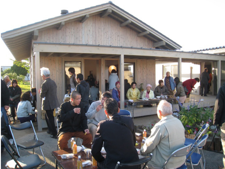
Fig. 3. Sendai “Home-for-all”.

Scattered communities and cramped living conditions do not enhance social cohesion in temporary housing complexes. In response to this issue, Toyo Ito and his colleagues of Kysin-no-Kai have created the concept of friendly places where the inhabitants could meet and share convivial moments [15]. That is the origin of the “Home-for-All” project ( みんなの家 Minna no ie ), with the installation of community spaces in the kasetsu jūtaku settlements after the disaster of 2011, which later expanded to various contexts [16].