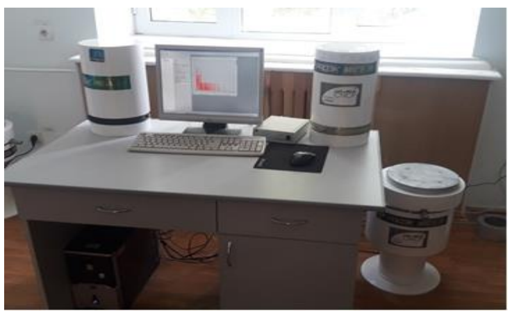
Figure 2. RADEK MKGB-01 radiometer

In this study, a radiometric method for the determination of radionuclides in food was used.