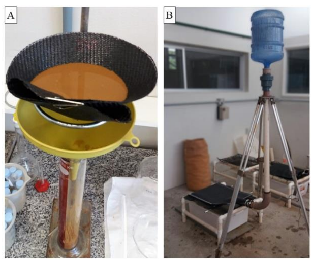
Figure 1. Assembly of tests: a) geotextile cone dewatering test; b) geotextile bag dewatering test.

The GCDT procedure adopted in this work was defined after preliminary tests were carried out to analyze the various suggested procedures in the literature. It consisted of pouring 400 cm<sup>3</sup> of WTP sludge into a previously folded cone-shaped geotextile, as shown in Figure 1a, and measuring the retained solids amount, filtrate solids content and volume collected over time. The test duration was set at 25 minutes so that there was sufficient time for the dripping to stop.