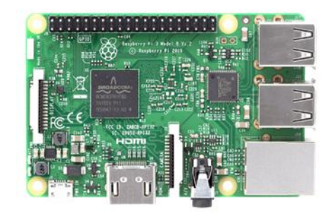
Figure 5. Plate Raspberry Pi [58].

This device is a computer small plate, computer single board or computer single board (SBC) whose price is affordable for low cost, which is developed in the UK by the Raspberry Pi Foundation, with the aim of stimulating teaching of computer science. The Raspberry Pi mostly used operating systems based on the Linux kernel. Raspbian a Debian-derived distribution that is optimized for Raspberry Pi hardware, see Figure 5.