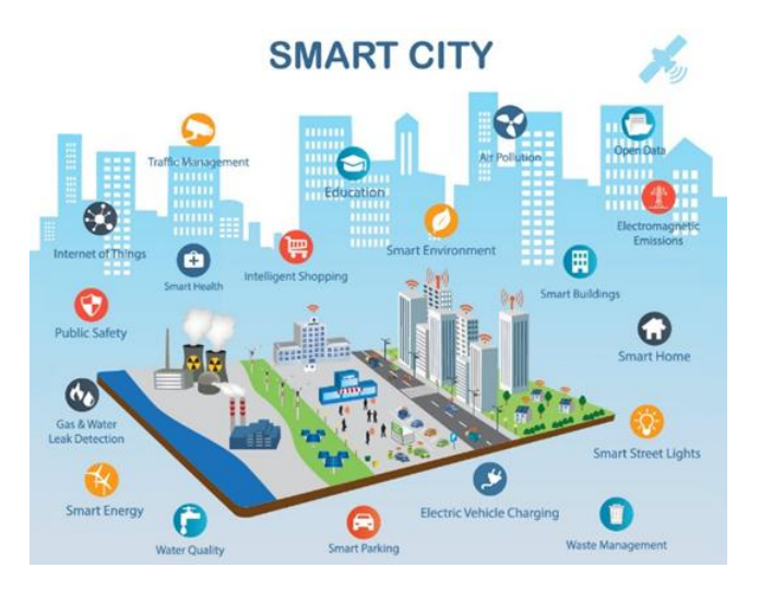
Figure 3. Illustration of the fundamentals of an intelligent city [53].

Smart measurements in public services in consumer spending enable better data spending for energy example, see Figure 3, each user by means of counters tele where readings remotely and in real time, which is being implemented much in are made electrical services and is booming to provide better services, also called Smart Metering [54].