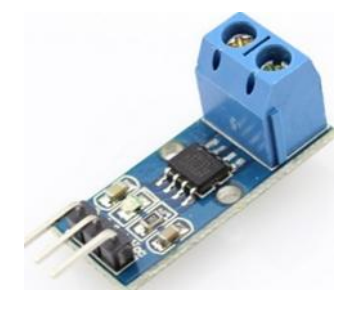
4.2.6. Sound sensor LM393

It is a small sensor based on the LM393 and a sensitive microphone, see Figure 8. For automation projects and automation works perfect, you can control lights, alarms, even a small sound follower robot