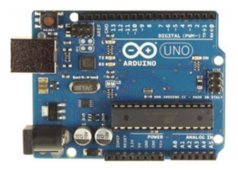
Figure 4. Arduino [57].

Arduino software is released as open source tools, available for extension by experienced programmers. The language can be expanded through C ++ libraries, and people wanting to understand the technical details can make the leap from Arduino to the AVR C programming language in which it is based. Similarly, you can add AVR-C code directly into your Arduino programs if you want (Arduino).