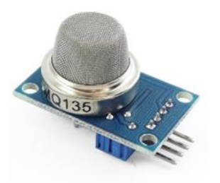
Figure 9. Air quality sensor MQ-135 [61].

This module is capable of measuring air quality in buildings / houses can detect the presence of: NH3, NOx, alcohol, benzene, smoke, CO2, see Figure 9.