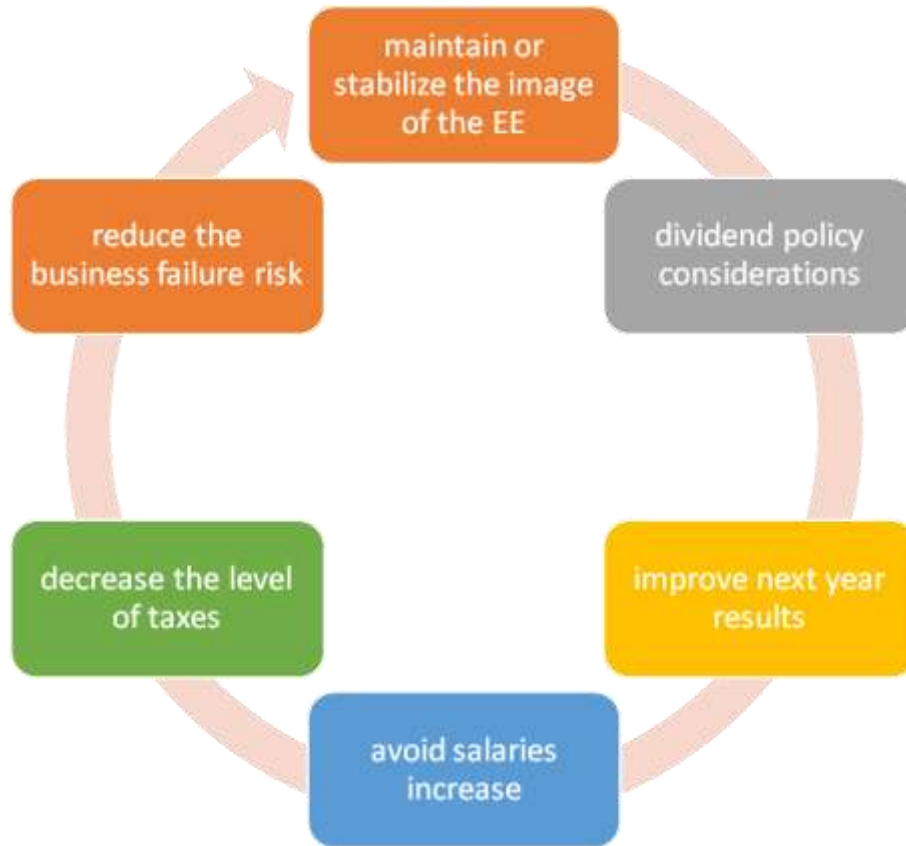
Figure 1. Factors to engage in creative accounting