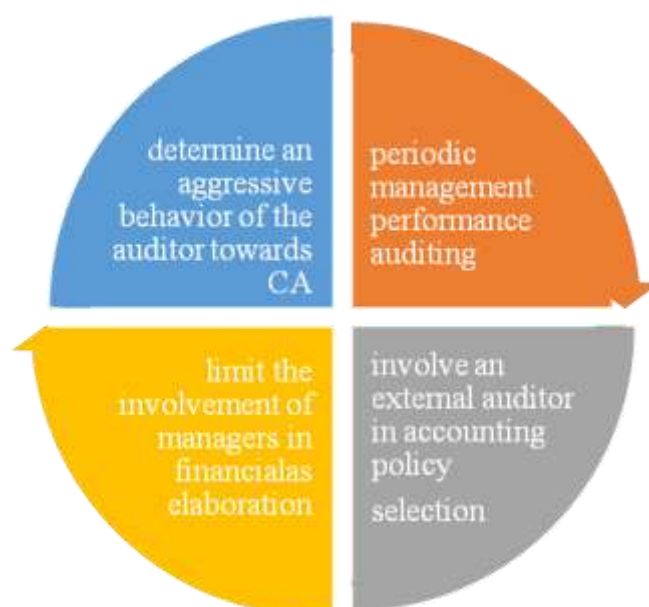
Figure 2. Control mechanism of creative accounting