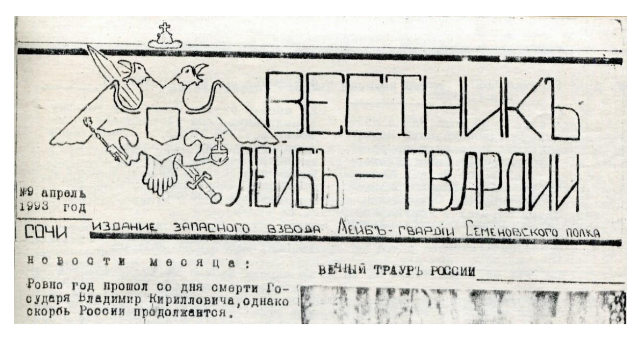
Fig. 1. The first page of the newspaper "Vestnik Leib-Gvardii" in the period 1992–1993

In the first period of the newspaper's existence, a double-headed eagle on the background of a sword was placed on the first page (Figure 1).