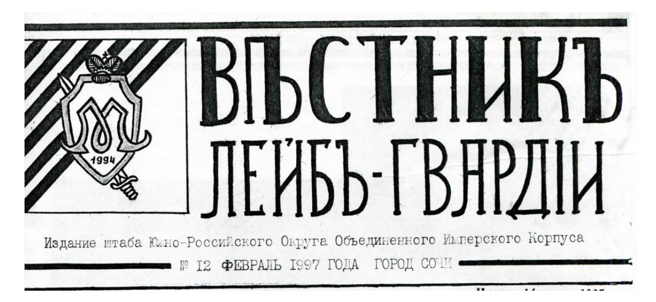
Fig. 2. The first page of the newspaper "Vestnik Leib-Gvardii" from February 1997

The title page of the newspaper changed only from the February 1997 issue (Figure 2). The double-headed eagle was replaced by a shield with the letter "M" and a crown. The newspaper's title incorporated Old Slavonic orthography.