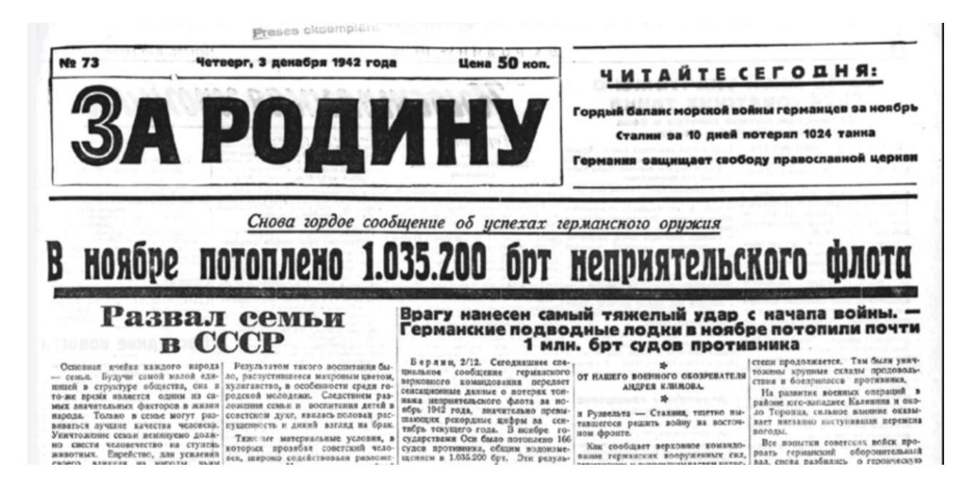
Fig. 1. Leading article in the December 3 1942 issue of the Za Rodinu [For the Motherland] newspaper