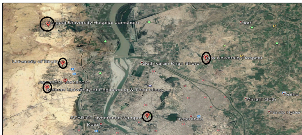
Fig. 1: Google Map representing the 5-HEIs of Jamshoro and Hyderabad, Sindh Pakistan included in the Study

LUMHS1-5, IS1-5 and SZABIST1 due to ethical concerns.