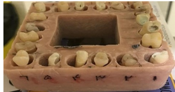
Figure1. The Preparation of the Block for Teeth Maintenance

group). The teeth from CEJ zone were kept within a block made of an equal mixture of Cold-Cure Acrylic powder (Acropars, Marlic Co, Iran), and bone powder of sheep skull to simulate hard tissue trabecular (Figure 1). The roots of the teeth were inserted into the molten red wax (Cavex, Netherlands) to create a resemblance through the PDL space and were then embedded in the mixture of the acrylic and bone powder.