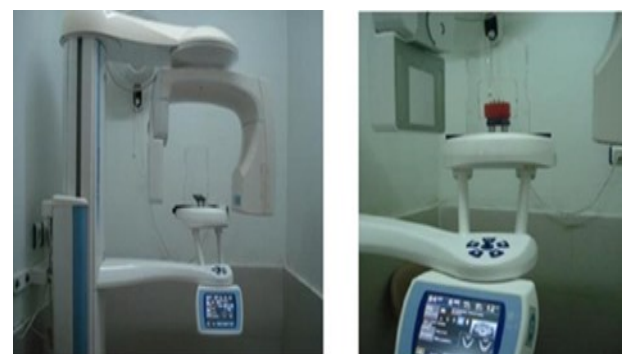
Figure2. The Samples placed on NewTom CBCT

CBCT Scans: The CBCT images of each block were made by a CBCT device (NewTom VGi, Verona, Italy) with the exposure parameters of mAS60 / 63, KV84 S4 / 5 and field-of-view (FOV) = 8 × 8, while protection protocol against X-rays was implemented (Figure 2). All images were imported to a desktop computer with a Samsung SyncMaster 2220WM 22-inch LCD monitor (Samsung, Seoul, South Korea). The CBCT images were evaluated using NNT Viewer version 3.00 [QR Srl]. The axial and cross-sectional image slices (1 mm thickness at 0.5 mm intervals) were examined by the assistance of a qualified oral and maxillofacial radiologist with the guidance of an eligible endodontist. None of the observers had prior knowledge of CBCT scans (Figure 3). Each examiner was permitted to use the Viewer software to regulate contrast, brightness and angulations in line with individual inclination.