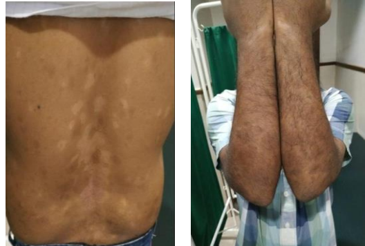
Figure 3 Figure 4 After Treatment MODE OF ACTION