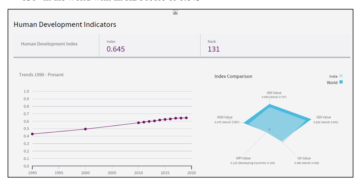
Figure 1.1: Human Development Index

a. Annual Income: Annual income of an individual is to be considered while assisting an individual for retirement planning. As per the human development index, India ranks 131<sup>st</sup> in the world with an HDI score of 0.645