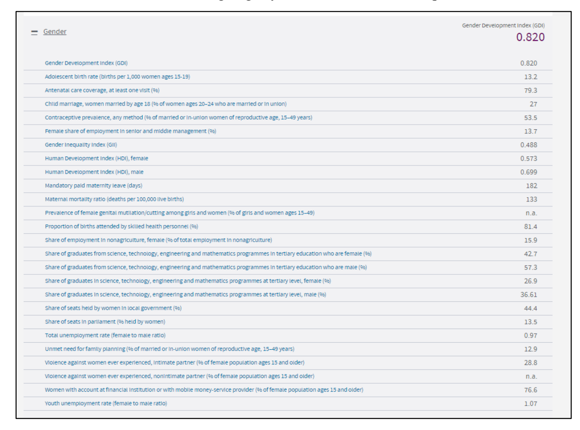
Figure 1.5: Gender distribution ratio

e. Gender Ratio: The gender development index in India stands at 0.820 currently with the female to male ratio being slightly inclined towards inadequate as follows: