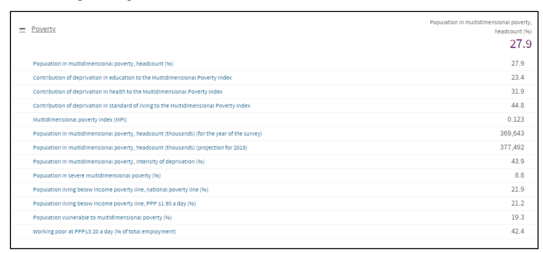
Figure 1.8: Poverty Index in India

h. Poverty: Among all the other developing nations, India has a higher concentration of poverty ratio (27.9%), hinting that this is also a major factor responsible for poor retirement planning in India.