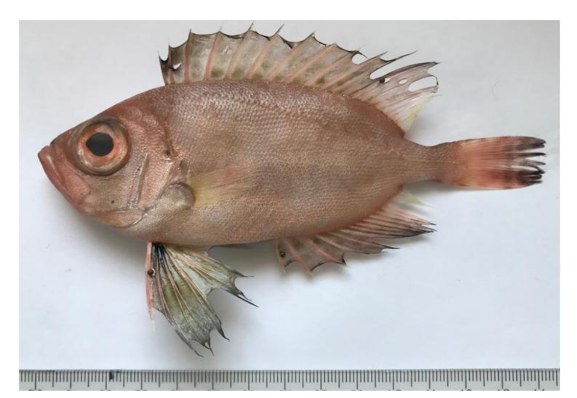
Figure 2. The presently reported specimen of arrow bulleye Priacanthus sagittarus , captured (10.6 cm, SL) from the Iskenderun Bay, Turkey

anterior pelvic fin base. Lower margin of the anal fin and the posterior part of caudal fin were blackish. The previous reports of P. sagittarus from the Mediterranean Sea are given in Table 1 together with the findings of the present study.