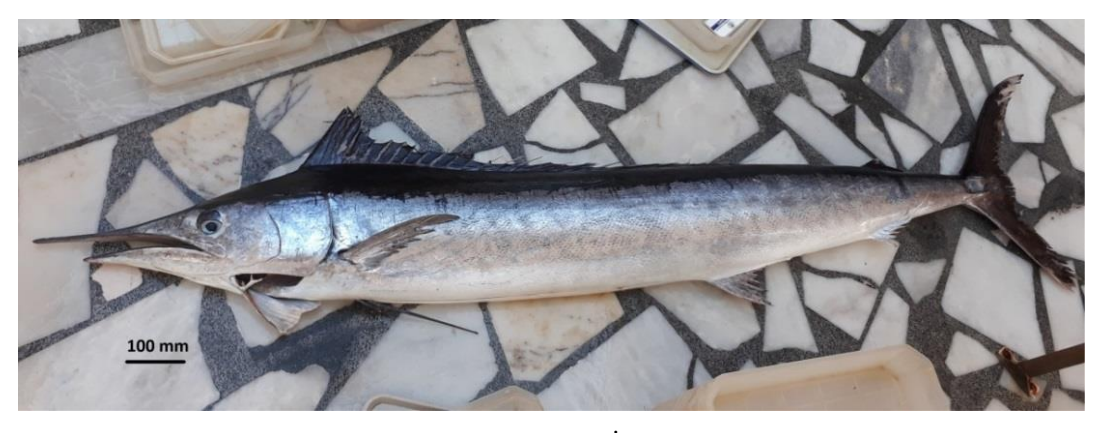
Figure 2. Fresh Tetrapturus belone specimen, captured from İzmir Bay, northern Aegean Sea