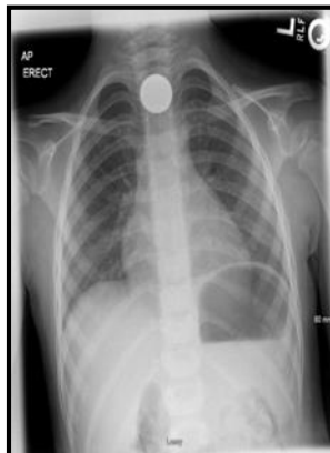
Figure 5 - Quarter stuck in 5 years old esophagus