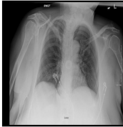
Figure 8 - Two buttons in the esophagus (AP view)