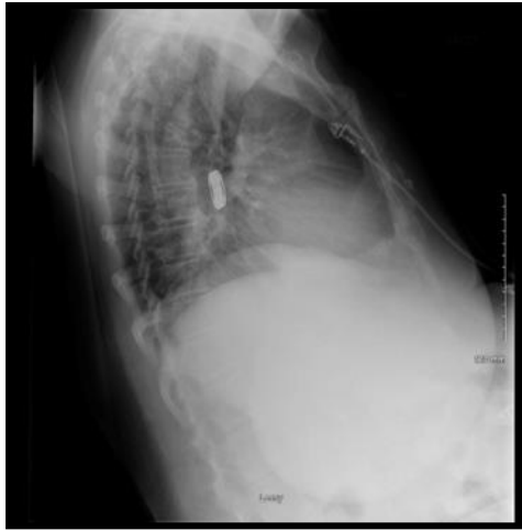
Figure 7 - Two buttons in the esophagus (lateral view)