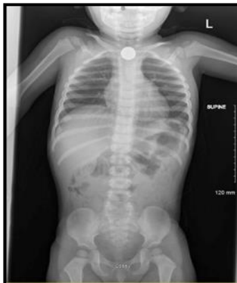
Figure 4 - Penny in 2 years old esophagus

The most common blunt objects are coins in children in US and China studies, followed by bony FBs, plastic bars and iron nails (Geng, 2017). (Figures 4-8) These should all be removed if in the esophagus, within 24 hrs if asymptomatic, 2 hrs if symptomatic or a button battery. If in stomach or below, follow if asymptomatic, remove if symptomatic (ESGE).