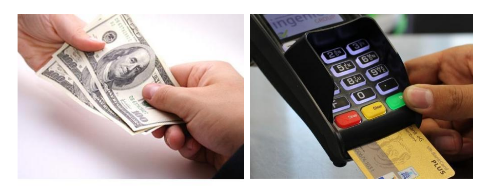
Fig. 1. Exemplary stimuli for cash and card payments*