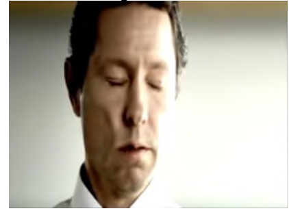
Sequence 2. 4.