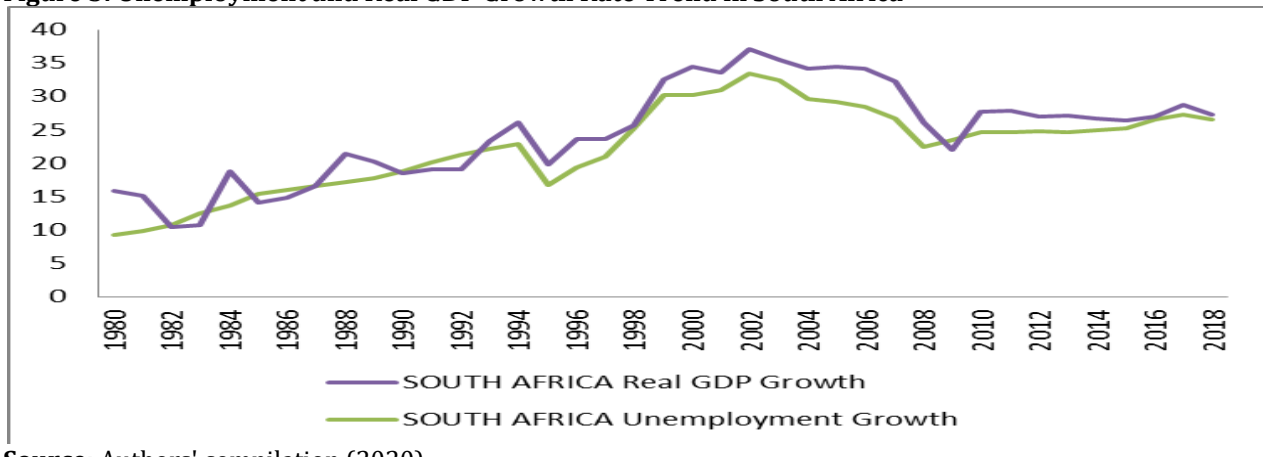
Figure 3: Unemployment and Real GDP Growth Rate Trend in South Africa

The South Africa case demonstrated conformity with the postulation of the Okun's Law as illustrated in Figure 3. Both variables are trended in the same direction and have continued on a rising spiral.