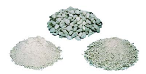
Figure 2. Fillers

Important properties in the polymerconcrete mix design shape (granulomorphism) and size (granulometry), filler distribution and filler weight fraction. Fillers for polymer-concrete adapted for engineering use consist of three to four components. The dimensions of the individual filler components range from 0.1 mm (stone meal) to 2 mm (sand) to 16 mm (gravel and stones) (Mráz and Talácko, 2006).