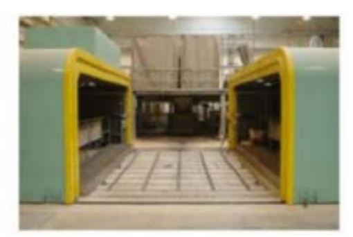
Figure 6. Vibrating table (platform)