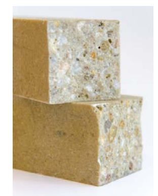
Figure 1. Cross-section of polymer-concrete product.