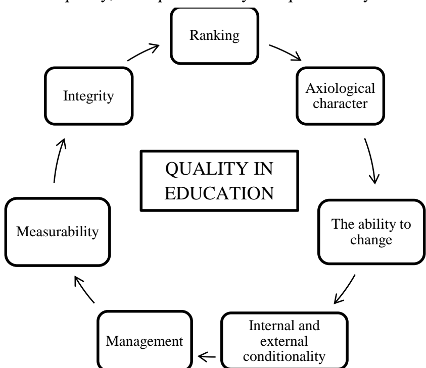
Figure 1. The defining elements of quality in education

Some defining elements of quality in education are highlighted (fig. 1). The most important of these elements is considered the completeness. The quality of object, process or phenomenon does not refer to characteristics treated separately, but integrated. So, other two important elements of the quality in education results - hierarchy and the capacity for change. The quality change could be spontaneous or directed. In the last case we can refer to the quality management capacity. Another important elements is the axiological character - different individual perception, adaptability to some or other objectives, conditions, needs of a particular person, social group or society in general. The degree of satisfaction of needs is determined by the degree of the quality expression. It creates the possibility to measure quality, both quantitatively and qualitatively.