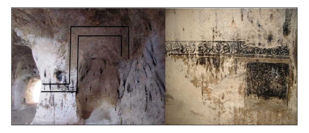
Image 2. The Quranic inscriptions of the collection of the Imamzadeh Ma'sum