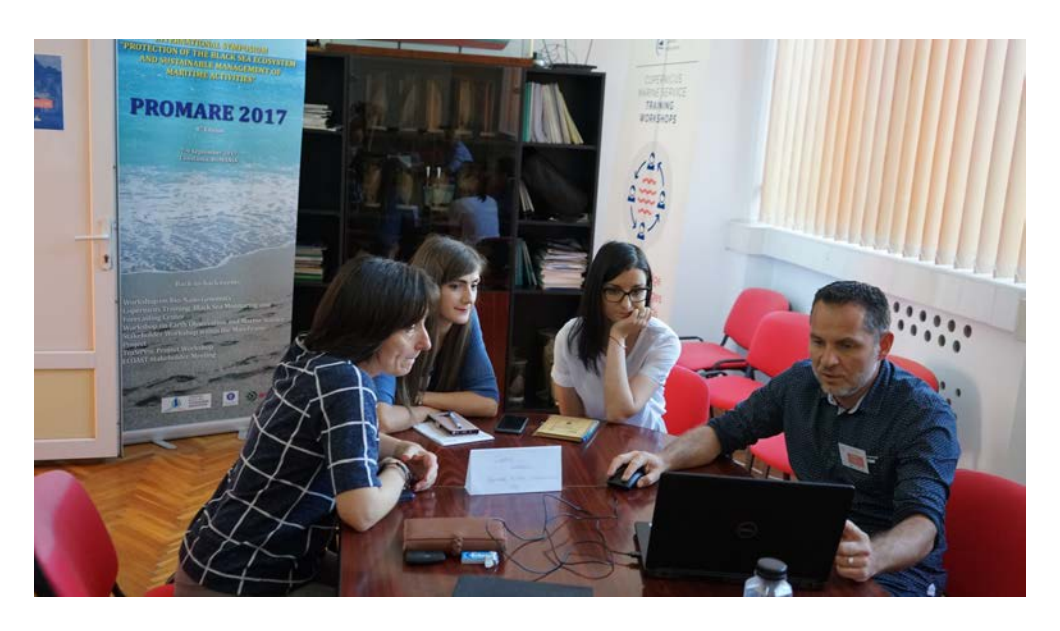
Fig. 6. Practical examples during with an interactive Speed Training (Copernicus Marine Service Training Workshop 2019 Black Sea).