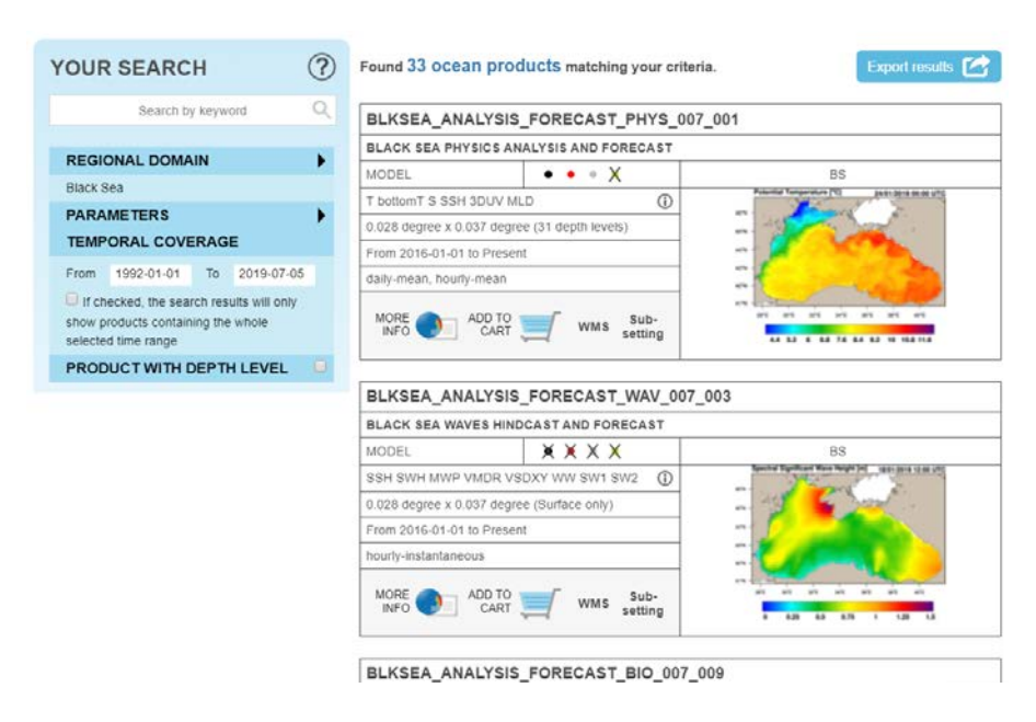
Fig. 2. CMEMS catalogue.