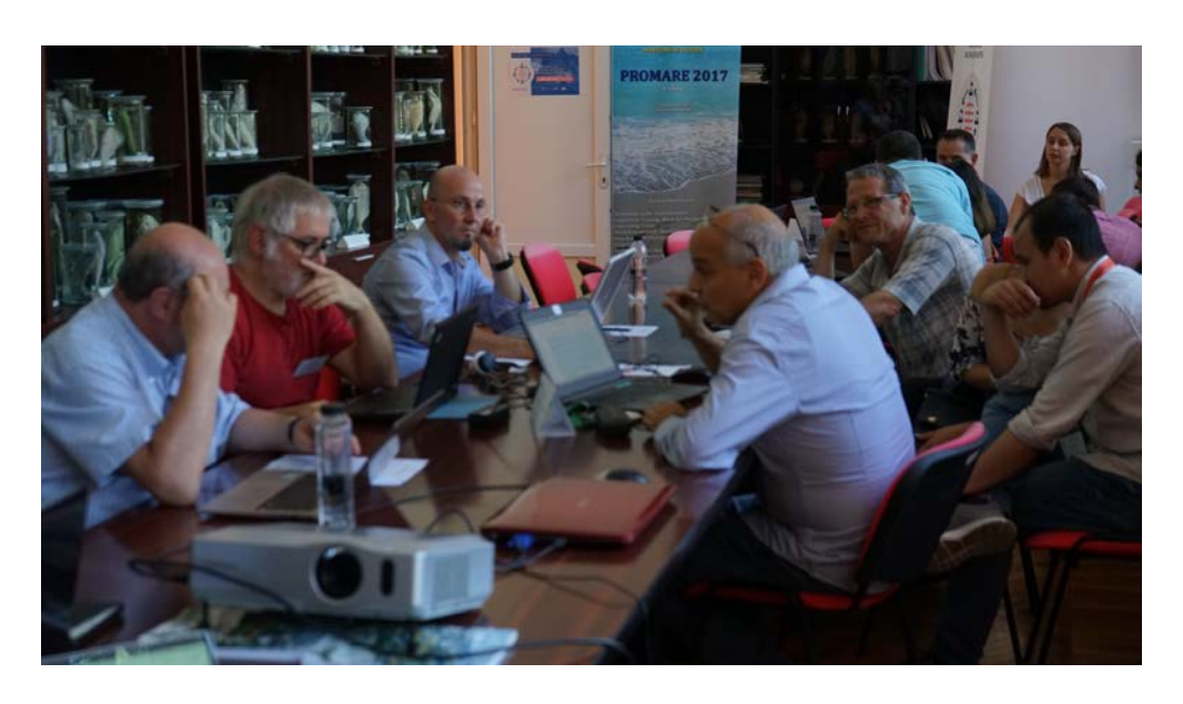
Fig. 5. Practical session during Copernicus Marine Service Training Workshop 2019 Black Sea ( original photo ).

Participants learned to search SeaLevel Satellite Observations data, to download a Level 4 product using the SubSet Download Service and Level 3 product using the DirectGetFile Service, to read a netCDF file and to plot the Copernicus SeaLevel Satellite Observations data, using Jupyter Notebook.