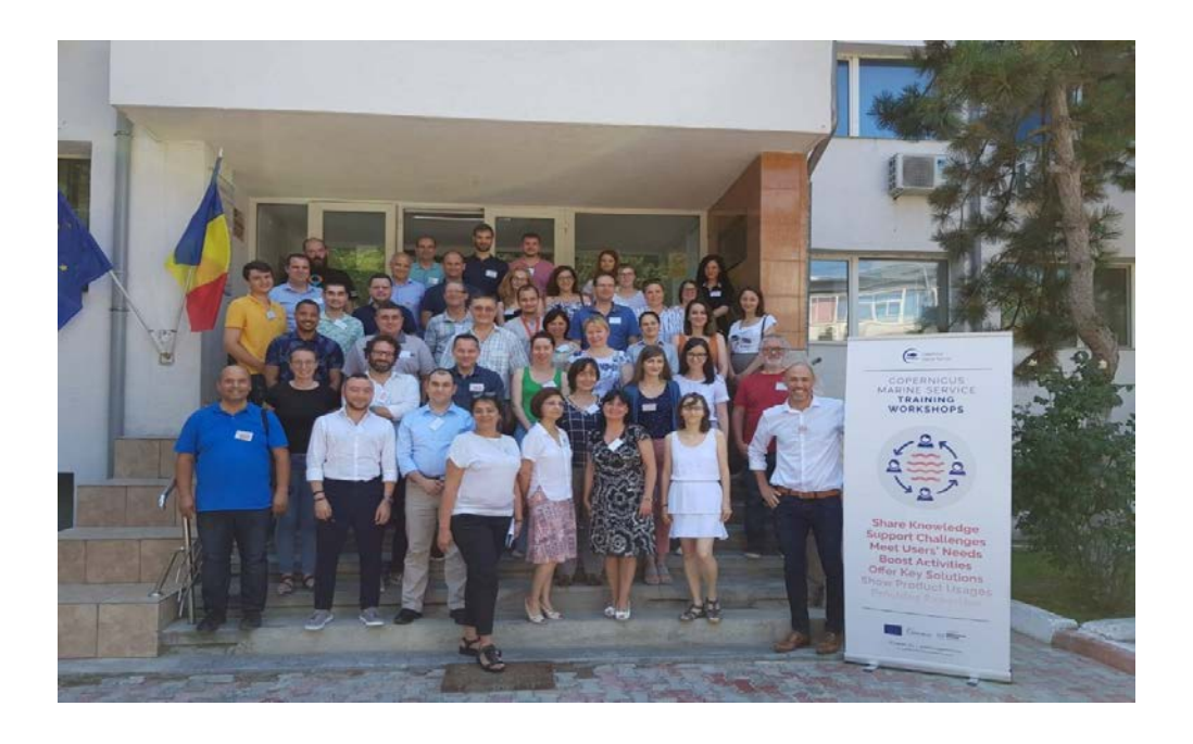
Fig. 7. Group Photo Copernicus Marine Service Black Sea Training Workshop, June 2019, ( original photo ).