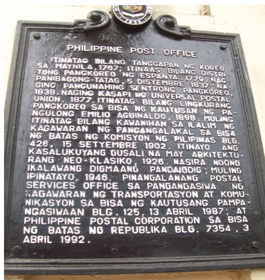
Image 1. Building history sign

more striking is the minimal presence of signs in Filipino despite the government directive (E.O. 335) to promote the use of Filipino in government office communications, including public signs. Image 1 shows the only monolingual Filipino sign in the publicly accessible area in the entire building.