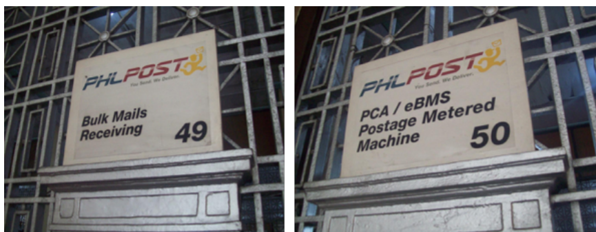
Image 3. Window labels