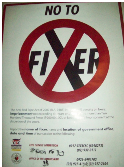
Image 5. Warning to the public

Essentially, fixers are people who promise to help process transactions faster in exchange for money. They are ubiquitous in government offices where transactions, such as getting an ID or filing an application, may take hours to complete. Such inefficiency thus makes fixers’ paid promise to expedite the process attractive to the public. Recognizing, however, that the practice of engaging fixers promotes corruption, government offices were mandated to publicize the law barring them.