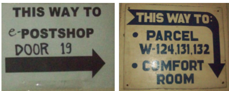
Image 4. Directive signs

The second predominant function of MCPO signs is directive (51 out of 138 signs). Directive signs help the public move efficiently around the office by indicating locations or the next step in a sequential procedure with the aid of arrows. Image 4 shows two examples of this.