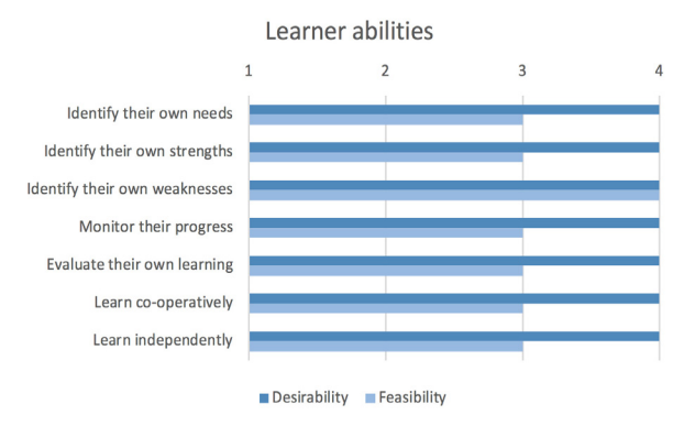
Figure 5. Desirability and feasibility of learner abilities as viewed by natural sciences students (1=Undesirable/Unfeasible; 4=Very Desirable/Feasible)