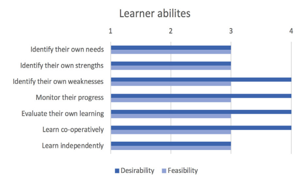
Figure 3. Desirability and feasibility of learner abilities as viewed by liberal arts students (1=Undesirable/Unfeasible; 4=Very Desirable/Feasible)