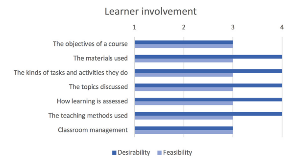
Figure 2. Desirability and feasibility of learner involvement as viewed by liberal arts students (1=Undesirable/Unfeasible; 4=Very Desirable/Feasible)

The next part of the questionnaire asks the students about their views on the desirability and feasibility of various learner involvement and learner abilities. The respondents are positive about their views on the desirability and feasibility of learning-to-learn skills and of their involvement in decision-making. Figures 2, 3, 4, and 5 show the desirability and feasibility of certain aspects of learner autonomy as viewed by the LA and the NS students.