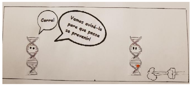
Figure 3 - The "OS DNAstutos" - Breast Cancer Predictive Tests Series<sup>8</sup>