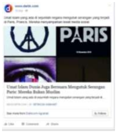
Figure 4. The News Update Posted by Detik.com

At the second sentence, VB's attack to Muslim involves verbal violence employing predicative strategy. This is linguistically realized as the word "hypocritical" at second sentence, meaning a character of which someone says that they have particular moral believe but behave in way which show that this is not sincere. The word "hypocritical" functions as predicate. Generally it shows meaning of bad or negatively sanctioned habit since being hypocritical is socially negative moral conduct. In connection with the news (Figure 4), the word "hypocritical" predicated to "They" (refers to Muslims) suggest that Muslims are not sincere of being sad and to condemn the attacker.