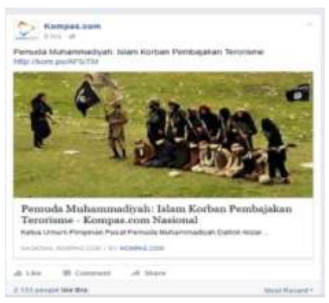
Figure 6. The News Update Posted by Kompas.com

In this post, the inter-textual relationship is signified by the presence of the excerpt and more clearly by the reference to At-Taubah verse 123 and 9. In connection with the earlier comment and reply, these inter-textual resources were presented to legitimize the notion of which Islam is mean and has confusing teaching. In the previous reply, the excerpt was also aimed to proof that Islam teaches killing. Inter-discursively the excerpt signifies intertwine between social media and religious discourse. In sum, the inter-textual resource constructs a validity claim upon the notion.