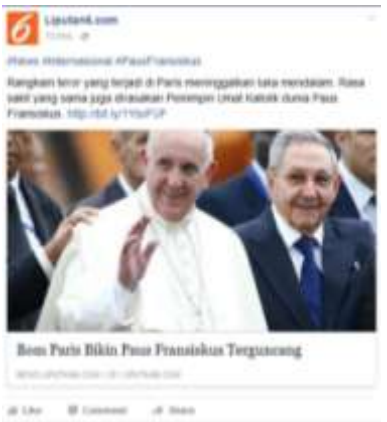
Figure 2. News Update from Liputan 6.com

Paris tragedy or known as Paris attacks was a series of coordinated terrorist attack that occurred on Friday, 13 November 2015 in Paris. The attack was coordinated and perpetrated by ISIS/ISIL (Islamic State in Iraq and Syria/ Islamic State in Iraq and Leviathan), an Islamist paramilitary group occupying some part of Syria and Iraq land and seeking to restore the caliphate. ISIS is best known for the use of violence. This attack prompted a massive response from the world. In social media including Facebook, Paris attack happened to be a trending topic. Most of the response were condemning the attack and showing support to Parisians. One of the popular yet cliché debate in the post 9/11 era related to the attack was the relationship between terrorism and Islam. Within that sociopolitical and historical context, Facebook users posted the comment.