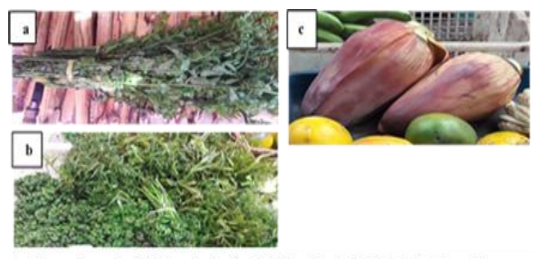
Figure 3. a. Bajei (Ceratopteris thalictroides): b. Kalakai (stenochlaena palustris); c. Jantung Pisang (Musa paradisiaca formatypica)

This acculturation has brought several food namesto Balinese transmigrants namely "makanpaku" and "makanjantung" like DayakNgajuusually call them. "Makanpaku" is a term used by Balinese transmigrants to refer to a food made of kalakai plants (Stenochlaena palustris) and bajei plants (Ceratopteris thalictroides). These plants belong to a group of ferns that grow abundantly on peatlands. "Makanjantung" is a term referring to a food made ofthe heart of banana plant as the basic ingradient (Figure 3).