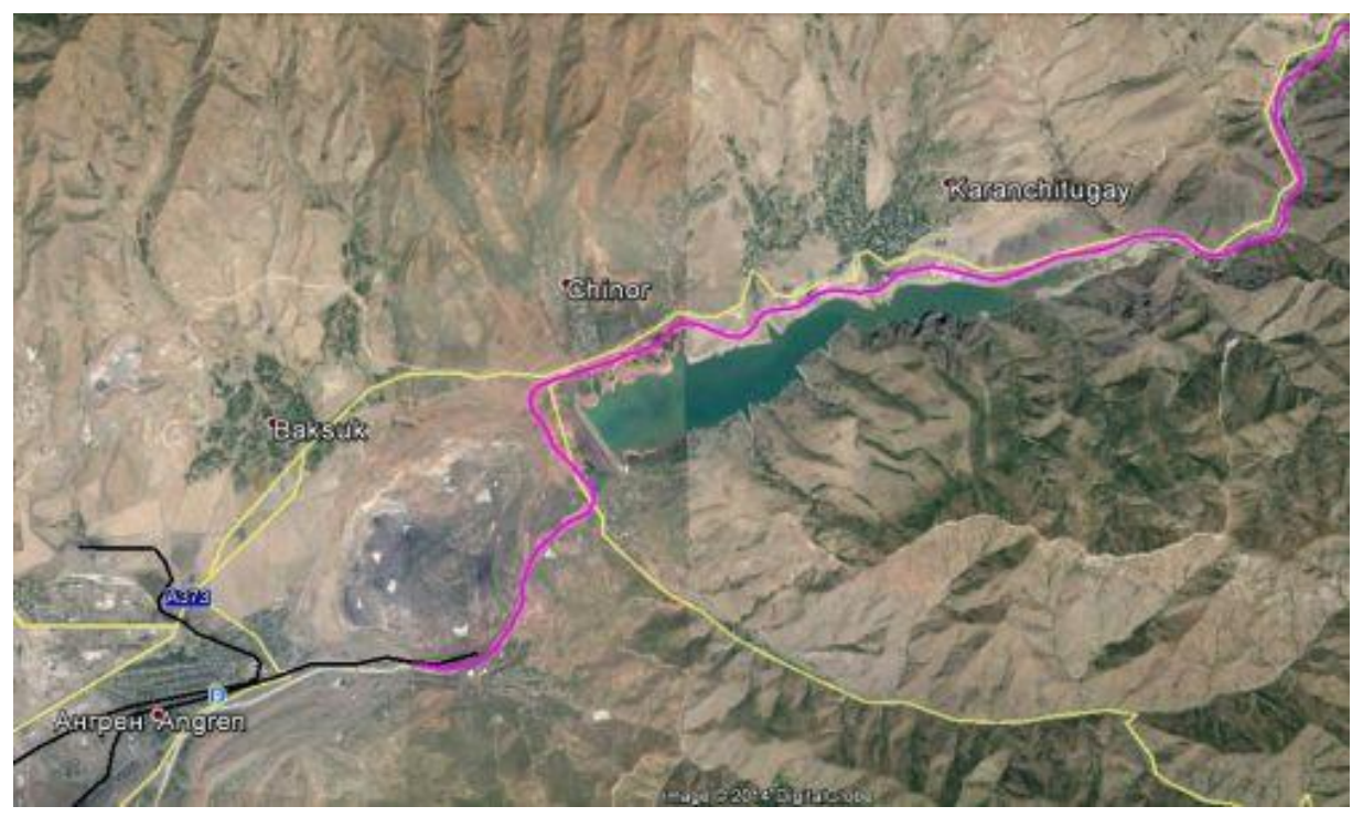
Pic 1.3. Map of railways in Tajikistan

This railway will reduce the dependence of Uzbekistan from Tajikistan. Now Tashkent needn't to transit through the territory of a neighbor. At the same time Uzbekistan become stronger position in relation to the Kyrgyz Republic. What does the construction of the railroad Angren - Pap for Uzbekistan itself and its neighbors? Let us see from a different perspective: