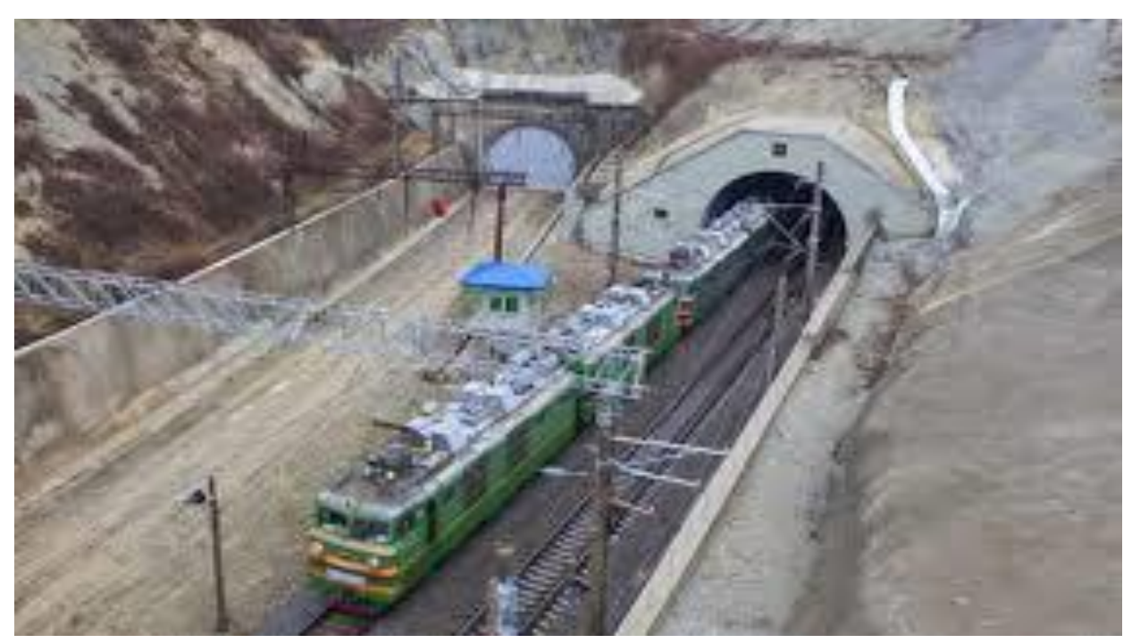
Pic 1.2. Type of tunnel

development of the economic potential of the three most populated areas of Uzbekistan, will allow several times to increase the volume of passenger and freight traffic, significantly reduce travel time .With the commissioning of the new line will not only be connected to the area of the Ferghana Valley with the central part of the country, and thus completing the formation of a unified railway transport system in Uzbekistan. In addition, this site will be an important link in the international transit corridor China -Central Asia - Europe.