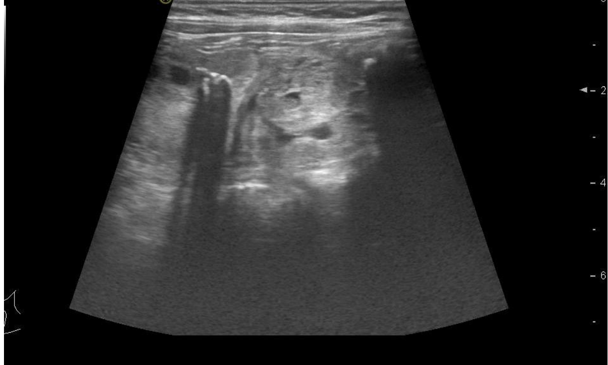
Fig. 1. Thyroid cancer. Fuzzy contours of education.Two-dimensional study in seroscale mode

Follicular cancer (n = 4) of the thyroid gland more often than other forms was characterized by hyperechoic and medium echogenicity nodes, the structure of which was also more often heterogeneous;