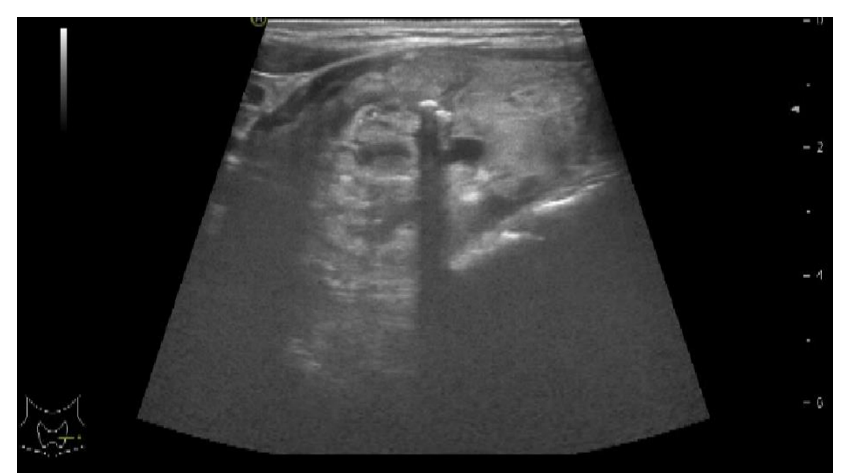
Fig. 2. Thyroid cancer. Irregular shape, uneven knot borders, small calcifications. Two-dimensional study in seroscale mode

less often than with other forms, calcifications occurred, more often - the rim of delimitation (Fig.2). Avascular and hypovascular forms were also more common.