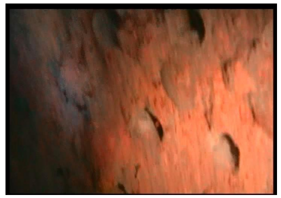
Figure 2. The process of clogging in the filter section of the inlet water well is shown.

In this article, we explored solutions to the aforementioned problems and measures to prevent their occurrence in the next step. Each problematic situation is analyzed separately, and their solutions are determined by their importance, and the overall economic effect is calculated by helping to increase the efficiency of water use. The measures will be based on the principals of sustainable development, which will satisfy the growing water demand of consumers due to future water shortages. Below is a real picture of one of these problems as a result of remote video analysis of artesian wells.