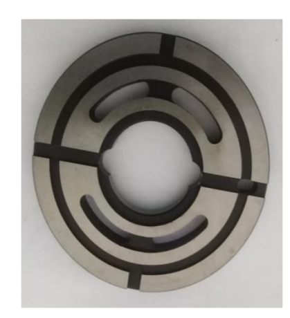
Figure 3 – The machined contours on the workpiece.

The machined contours on the workpiece are presented in the Fig. 3. The contours dimensions and the surfaces roughness after electrical discharge machining were sustained.