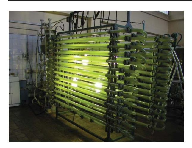
Fig. 2. Experimental tubular photobioreactor of biotechnological complex of the Institute of Hydrobiology of the National Academy of Sciences of Ukraine