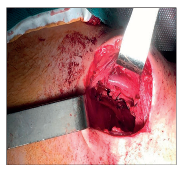
Figure 6 . Functional neck dissection and external carotid artery ligation on the left side of the neck.