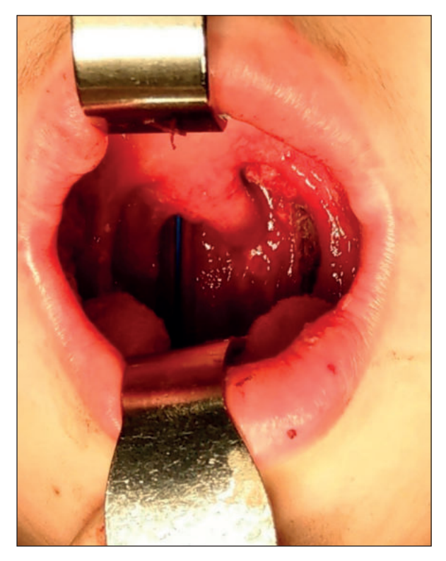
Figure 8. Intraoperative aspect after the tumor was removed and the reconstruction of the tongue and floor of the mouth were performed.