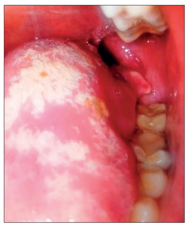
Figure 3 . Primary tumor at the beginning of the symptoms. Vegetative tumor arising from the oral tongue, floor of the mouth and retromolar region.