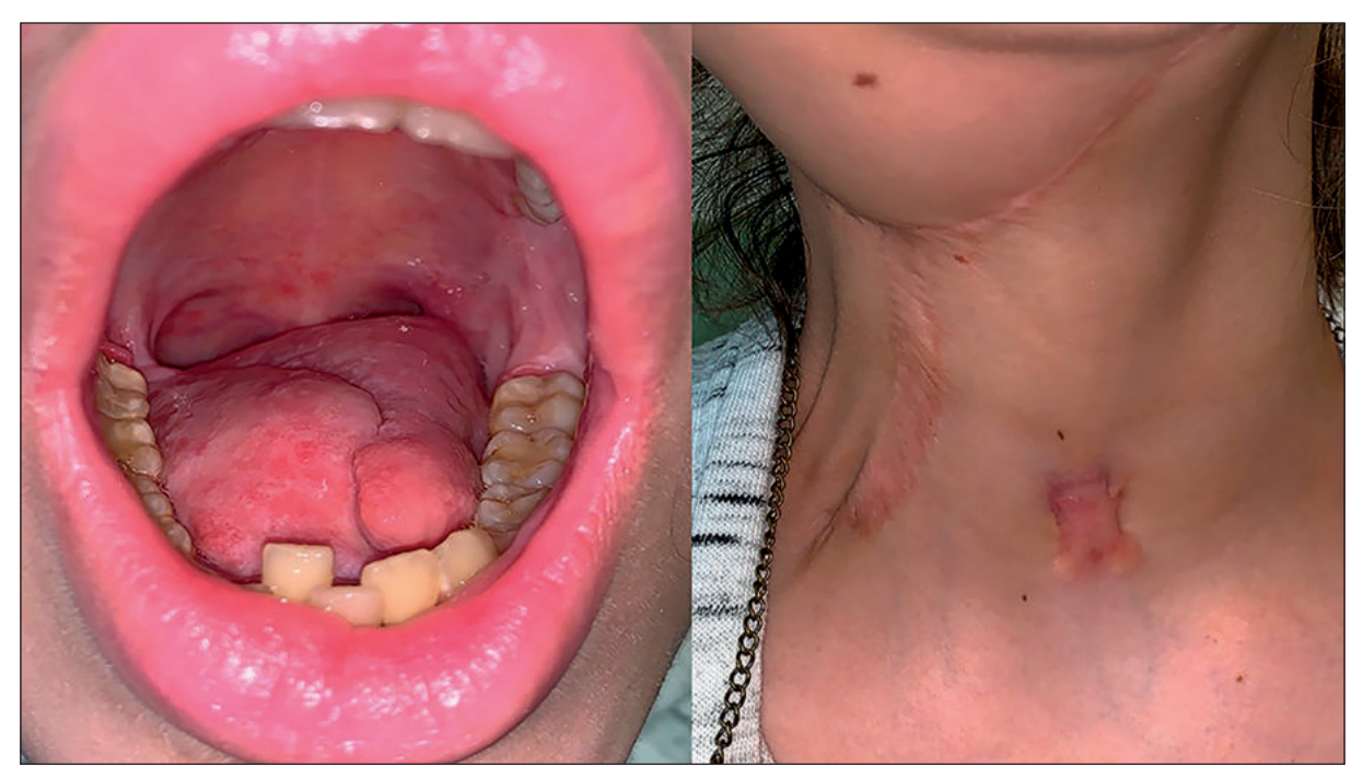
Figure 2. Intraoral and cervical aspect at 15 months post-surgery.