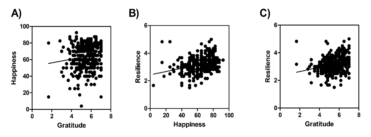
Figure 1 Relationship between gratitude, happiness and resilience. (A-C) Scatterplot diagrams of gratitude, happiness and resilience showing a positive significant but weak correlation amongst the variables.

resilience was also significant (r = 0.31, p<0.001). Based on the analysis, these relationships were expected because gratitude has been reported to be associated with happiness (Emmons & McCullough, 2003; Maltby et al., 2005; McCullough et al., 2002; Watkins et al., 2015; Witvliet et al., 2019) and has an enhancing effect of resilience (Mary & Patra, 2015). The correlation between happiness and resilience is also consistent with the recent finding that happiness may play a significant role in boosting resilience among college students (Short, Barnes, Carson, & Platt, 2020).