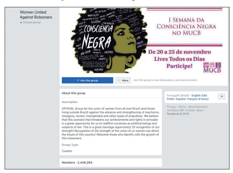
Figure 3 – Women Online Organisation: Facebook Group "Women United Against Bolsonaro"