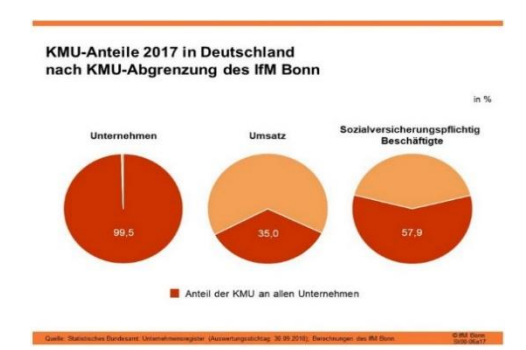
Figure 1. SMEs' share in 2017

SMEs thus contributed 57.8% of the total net value added for all companies in 2017 (Institut für Mittelstandsforschung, 2019).