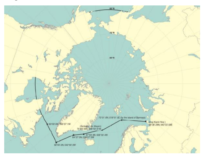
Fig. 3. The area of the Polar Code in Arctic waters.

The first part of the Polar Code describes the sources of danger, requirements for the equipment of vessels, materials suitable for operation at operating polar temperature, fire safety, etc. The vessel itself must have a certificate for a polar sailing vessel and a ship's manual for operation in polar waters.