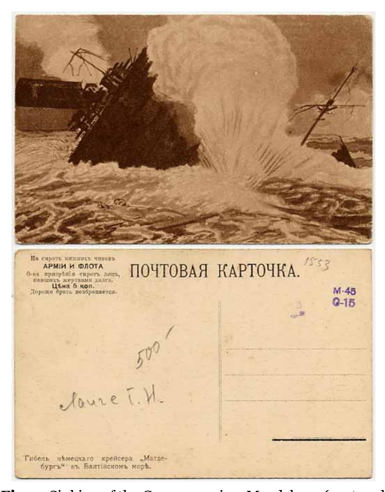
Fig. 2. Sinking of the German cruiser Magdeburg (postcard).

As early as November of 1914, they started to publish the roster of officers in the Russian navy who died, were wounded, or went missing as a result of battles during World War I (Spisok offitserov flota..., 1914).