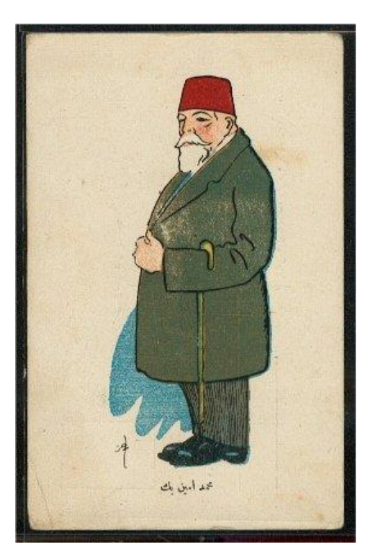
Fig. 3. Sultan Mehmed V (postcard)

In addition, the Turkish navy was a rather advantageous target for Russian military propaganda. This fact was best expressed by Academician M.N. Pokrovsky: "If Russian admirals do not make preternatural errors, our edge over the Turkish fleet will well be assured" (Pokrovsky, 1928).