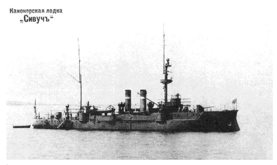
Fig. 1. Gunboat Sivuch

artillery fire, and the other one ran into a mine barrier, blew up, and sank. The crew of the gunboat Sivuch fought a successful battle against the cruiser Augsburg and two German destroyers (RGA VMF. F. 716. Op. 1. D. 187. L. 112) (Fig. 1).