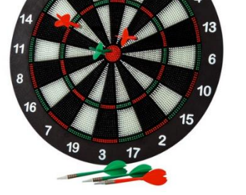
Figure. 1 Equipment of darts game

In this section, the potential of Darts game is