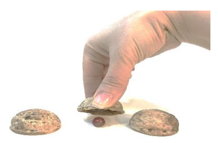
Figure. 1 Shell game

gestures. Now the operator asks the players to guess the shell under which the ball is hidden. Each player may choose the correct or wrong shell, depending on the degree of accuracy and intelligence. More points are awarded to the player that recognizes the correct shell.