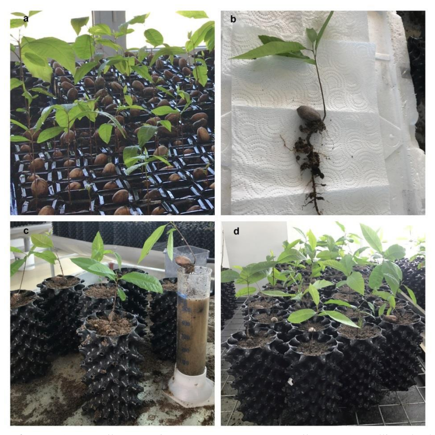
Figure 1. Germination of pecan ( Carya illinoensis )in peat (a), pecan ( Carya illinoensis ) seedlings(b),the solution to be used for the inoculation and the inoculating process (c), the inoculated pecan seedlings left to grow (d)