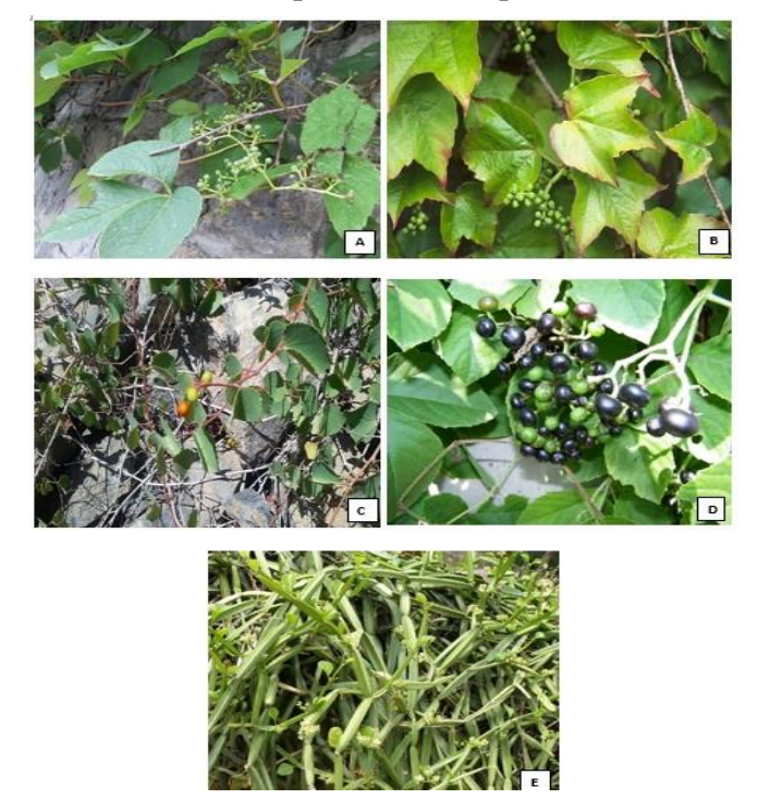
Fig. 1. Field photographs (A) Parthenocissus semicordata (B) Parthenocissus tricuspidata (C) Ampelopsis vitifolia subsp. hazaraganjiensis (D) Cissus trifoliata (E) Cissus quadrangularis

To find average, five consecutive values were noted. Mean value and standard for each feature was calculated by using statistical software IBM SPSS Statistics 20. Values are presented as