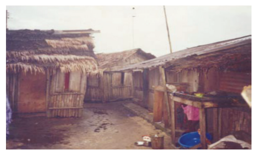
Figure 3: Common Housing Pattern in Typical Niger Delta Coastal Communities in Nigeria.

A feeling of fiscal deprivation possibly led to frustration, aggression and the violent demand by youths for a fair share of the resources from the region which now manifests as piracy and sea robbery as a backlash effect of the fiscal deprivation and poverty suffered by the coastal communities in Nigeria. A sight of the housing and living pattern in the coastal communities of Nigeria evidences further the incidence of poverty and deprivation. See Figure 3 below.