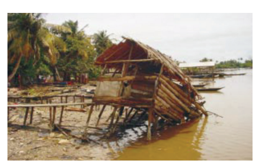
Figure 4: Common Toilet House Found in Most Coastal Communities in the Niger Delta.

Examining the piracy and armed robbery attacks against the industrial fishery sub-sector in the GOG and Nigeria maritime domain which constitute a major act of aggression and violence induced by the unrelenting drive by the youth of the coastal states and communities to derive economic gains from the business activities and operations in their maritime domain in a bid to escape the pang of poverty: the frustration-aggression theory (FAT) becomes a perfect explanation of the violence and attack against the ocean fishery industry by the youths of the coastal states in Nigeria in particular and the GOG states in general. The work of reference [11] notes that some of the youth involved in acts of violence and aggression against safe maritime operations have in the past risen to become prominent political actors, leaders and men of affluence in the region with connections to high ranking security personnel, politicians and government officials. The later fact becomes a motivating factor for younger youth to tow the line of piracy and aggression against maritime operators as the only avenue for economic advancement and escape from poverty.