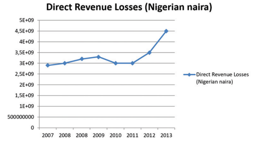
Figure 1: Direct Revenue Losses by the Nigerian Industrial Trawler Fishery Sub-sector Occasioned by Pirate Attacks.

While the direct financial losses to the sub-sector are as shown in Figure 1 above, the indirect losses occasioned by output losses to the society as a result of injuries and deaths suffered by fishing crew need to be estimated as basis for economic justification to investment in programmes and policies for the fight against piracy